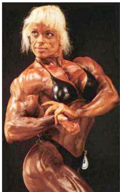
Fit or Grottesque?

The benefits of Olympic weightlifting don't end with strength, speed, power, and flexibility. The clean and jerk and the snatch both develop coordination, agility, accuracy, and balance and to no small degree. Both of these lifts are as nuanced and challenging as any movement in all of sport. Moderate competency in the Olympic lifts confers added prowess to any sport.