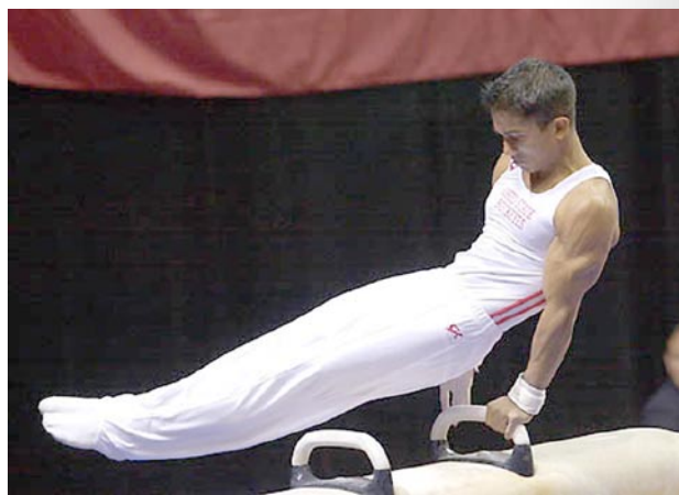
Our use of the term “gymnastics” includes all activities where the aim is body control.

While developing your upper body strength with the pull-ups, push-ups, dips, and rope climb, a large measure of balance and accuracy can be developed through mastering the handstand. Start with a headstand against the wall if you need to. Once reasonably comfortable with the inverted position of the headstand you can practice kicking up to the handstand again against a wall. Later take the handstand to the short parallel bars or parallettes ( http://www.american-gymnast.com/technically_correct/paralletteguide/titlepage.html ) without the benefit of the wall. After you can hold a handstand for several minutes without benefit of the wall or a spotter it is time to develop a pirouette. A pirouette is lifting one arm and turning on the supporting arm 90 degrees to regain the handstand then repeating this with alternate arms until you’ve turned 180 degrees. This skill needs to be practiced until it can be done with little chance of falling from the handstand. Work in intervals of 90 degrees as benchmarks of your growth – 90, 180, 270, 360, 450, 540, 630, and finally 720 degrees.